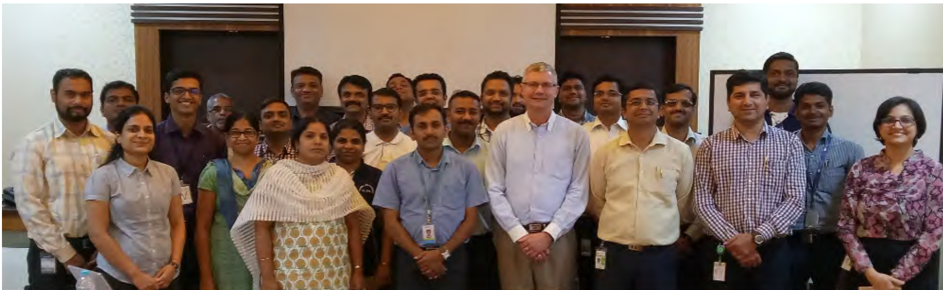
India Chapter – Pune Circle Event