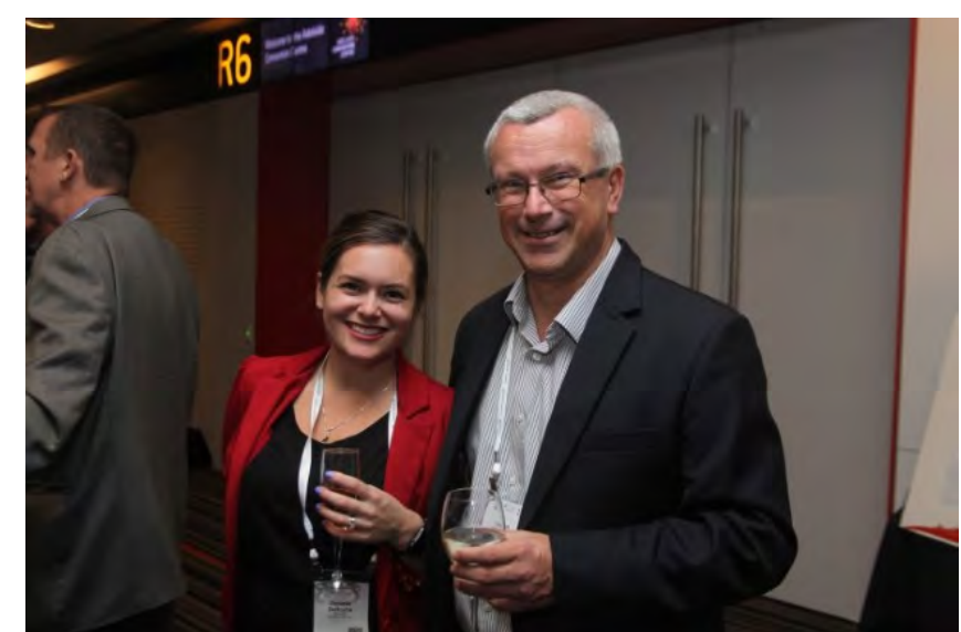
INCOSE President taking a break from official duties* at the INCOSE IS 2017.