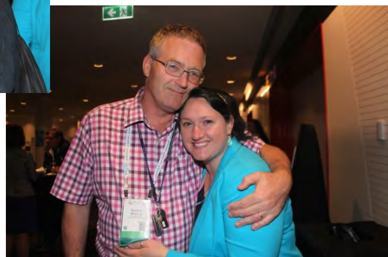
More member fun at the INCOSE IS 2017!