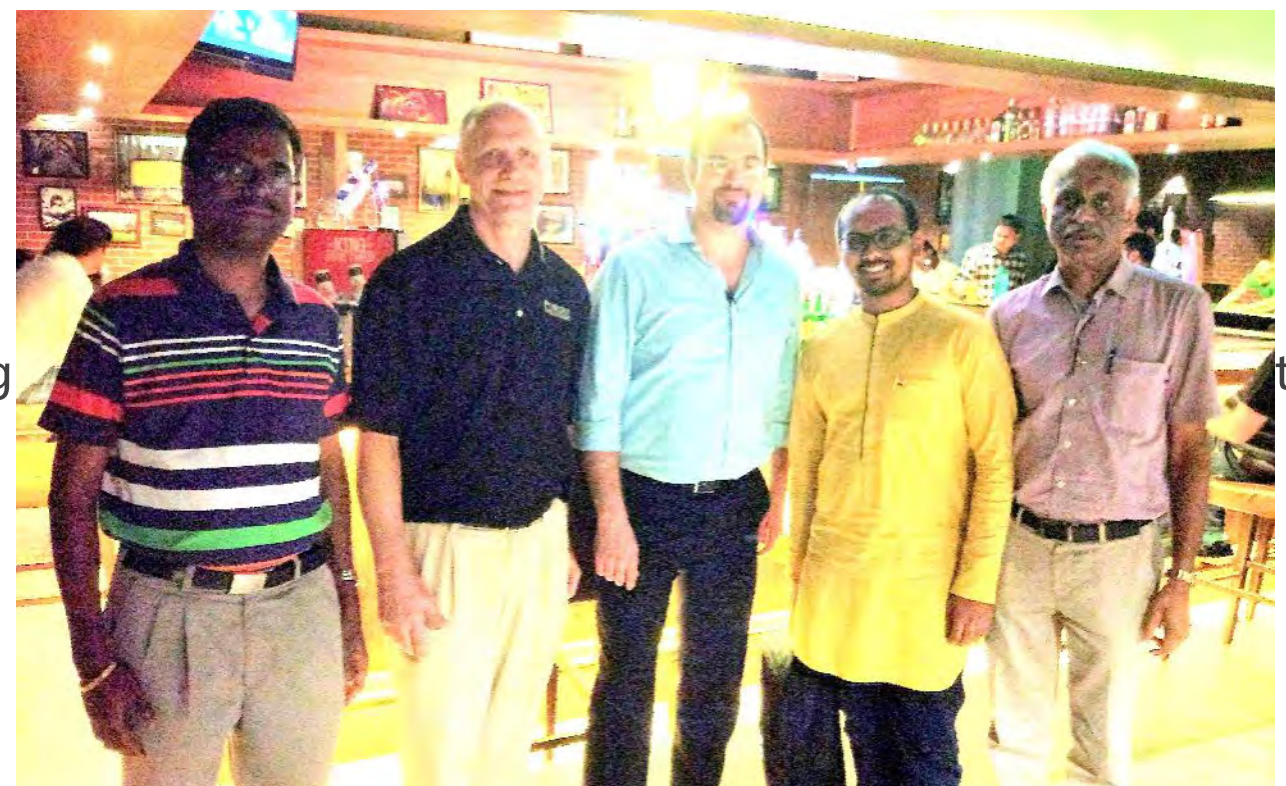
India Chapter – Bangalore Circle Event