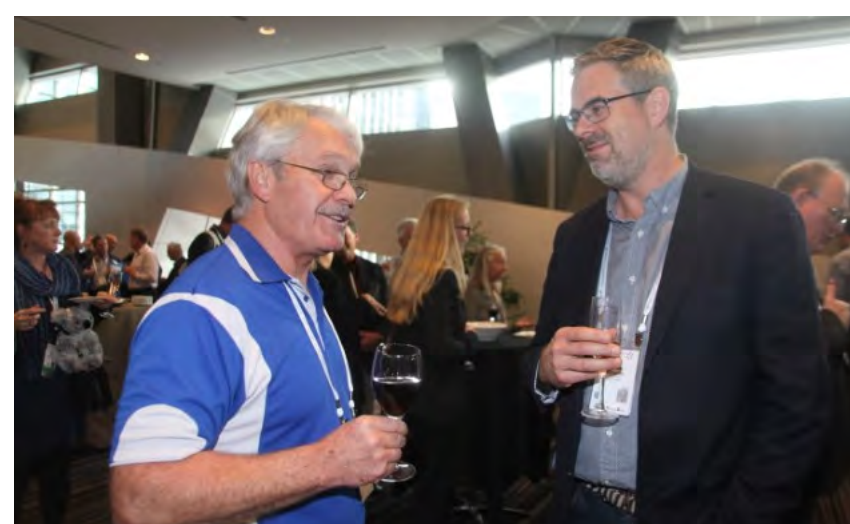
SA representation at the INCOSE IS 2017

The thirteenth INCOSE South Africa (SA) Conference 2017 will be on Wednesday through Friday, October 11-13, 2017 at the CSIR Convention Centre in Pretoria, South Africa. In addition, on Thursday morning, October 12, there will be a Systems Engineering Professional examination session.