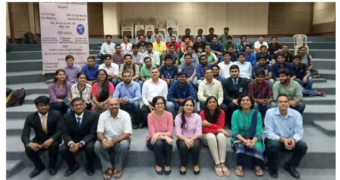
India Chapter – Workshop in NITIE, Mumbai