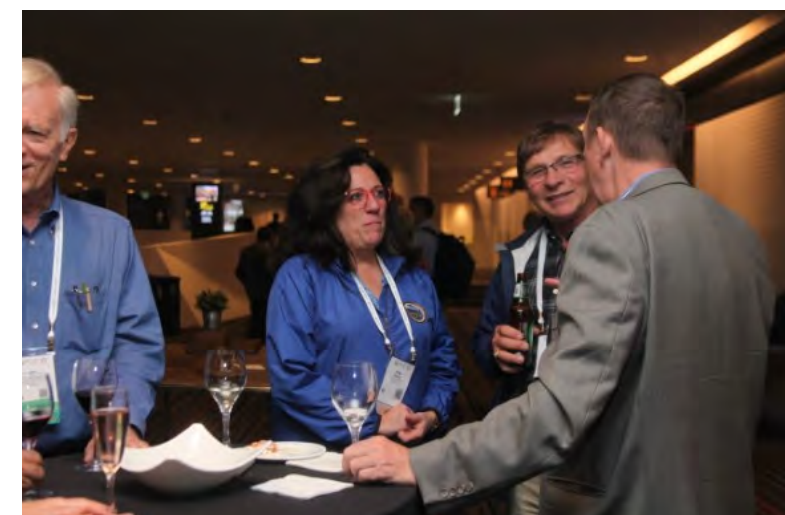
INCOSE CSEPs Celebrating Certification at the INCOSE IS 2017!

Finally he states: “There are three more articles at the lower level (healthcare delivery, lean in healthcare, and systems biology). We are hoping to plan a few more, but we do not have the right authors lined up. I am very happy to consider more detailed articles sponsored by the Healthcare Working Group, but the SEBoK editorial board will not validate them until other application domains catch up to us.”