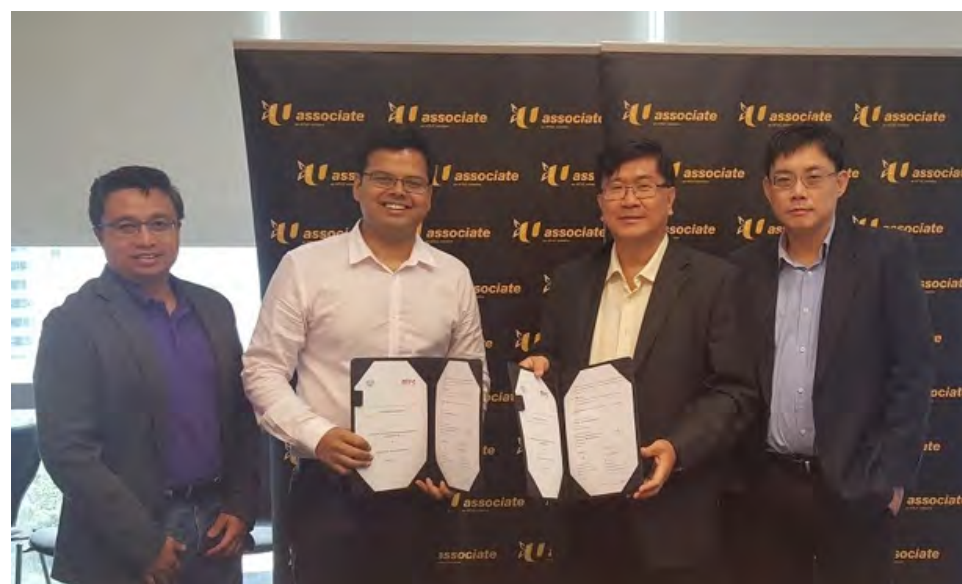
MoU signing with NTUC

For registration, sponsorship, or more information, visit our conference website, http://www.incosesaconference.co.za .