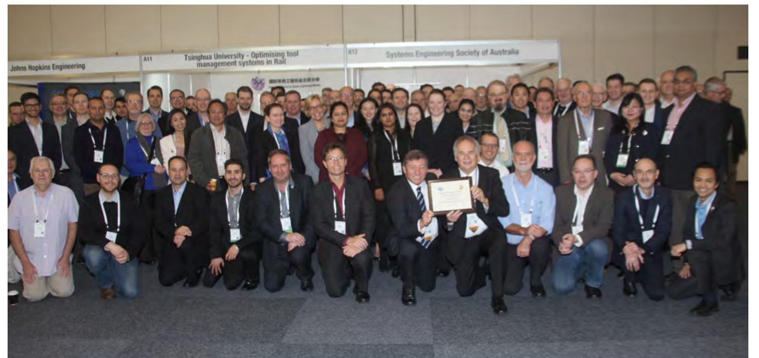
SESA Members cannot fit in the photo where they commemorate their INCOSE Gold Chapter Circle Award.

SESA was proud to host the 27th INCOSE International Symposium in Adelaide. It was a rare treat for Australian systems engineers to participate with the larger INCOSE parent in this premier event. We trust that all our international guests not only enjoyed the symposium, but also got to taste some of the delights of our lovely country. The International Symposium, 2017 was a shot in the arm for systems engineering in Australia, and a real boost for SESA with membership numbers increasing by ~50%. In fact, the response by SESA members was such that they could not all fit in the group photo, where we proudly displayed our Gold Chapter Circle award.